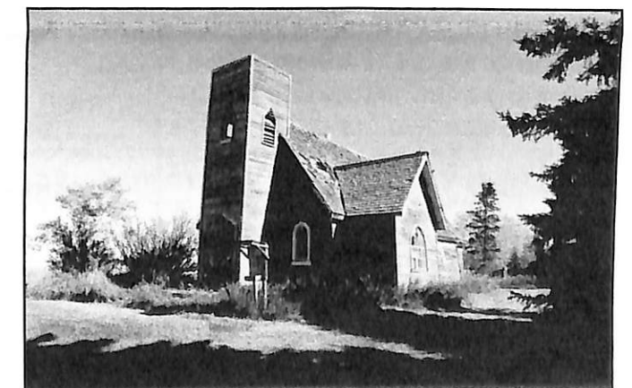
St. Anne's Church, Bresaylor, SK