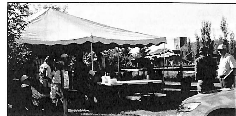
With the Brainstorming session over, everyone gathers for the potluck supper. Note St. Anne's church in the background.